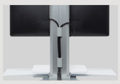
On-board cable management keeps area neat and organized.